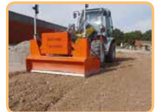
Exact base court = high savings potential for fine base material!