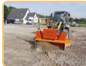
Material distribution and levelling in back- and forwards movement,