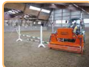
Levelling of riding sand. Ideal for riding arena construction.