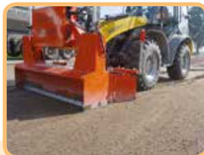
Accurate levelling to the millimeter of the bedding,