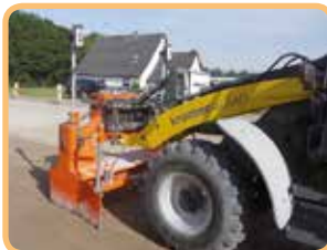
Fast assembly and disassembly,