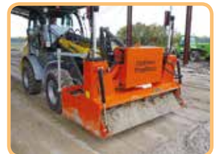
PlanMatic with hydraulic folding shovel

Equipped standardly with Leica system components. Additional Leica components available on request.